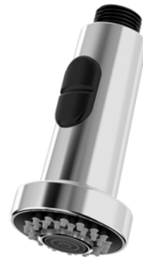
Code 4180537 Round ABS hand shower with anti-limestone system

Please see the product catalogue for further details.