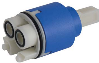
Code 412960070 Ceramic cartridge D35 with distributor