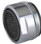
Code 412960051 Chromed aerator M24x1